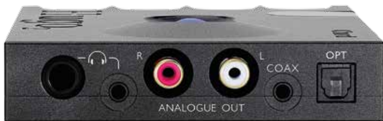
ABOVE: Conventional digital ins and analogue outs are all grouped on one end of the Hugo 2, with new high-quality labelling: both 3.5mm and 6.35mm headphone outs are provided, plus line audio on RCAs and optical/coaxial digital inputs

offering a more ‘out of the head’ listening experience.